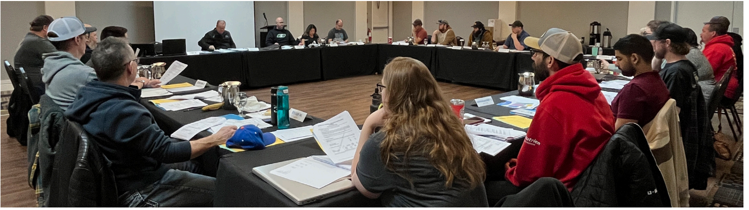
Members of the Joint Executive Council gathered in Regina, SK in March for their annual meeting.